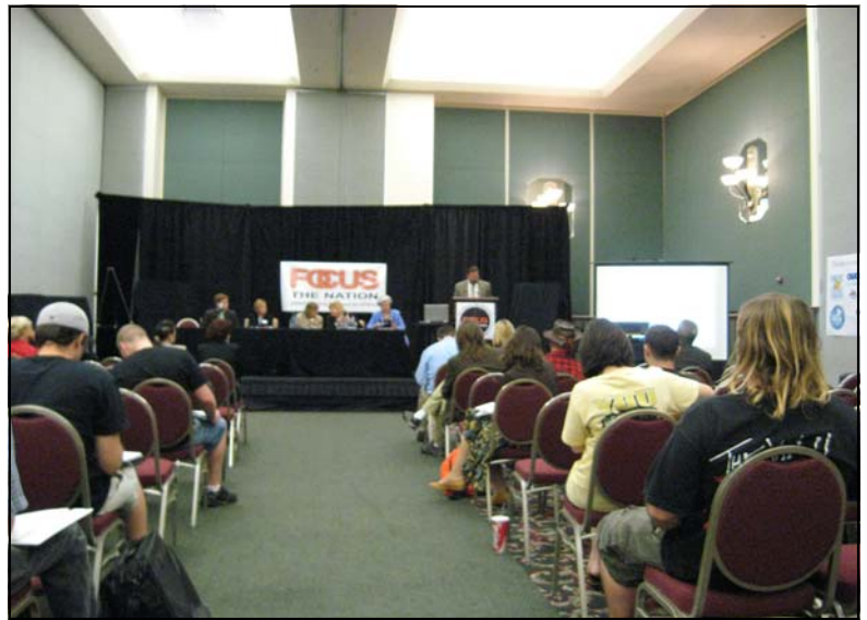
A panel comprised of local, regional, state, and federal leaders discussed their role in solutions to climate change.

Thanks to the International Society of Arboriculture, we have a new, mature trumpet tree (tabebuia), right outside Phillips Hall. Its plaque will honor UCF's efforts to Focus the Nation on Solutions to Climate Change.